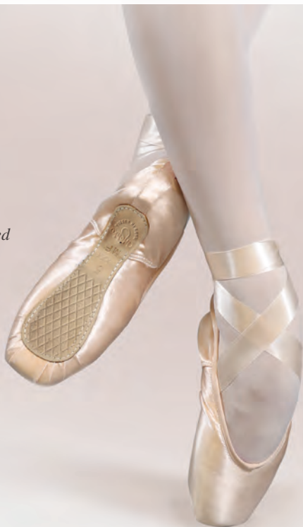
Last type: Grishko 2007

Wider fore sole for improved balance, noise reduction and traction